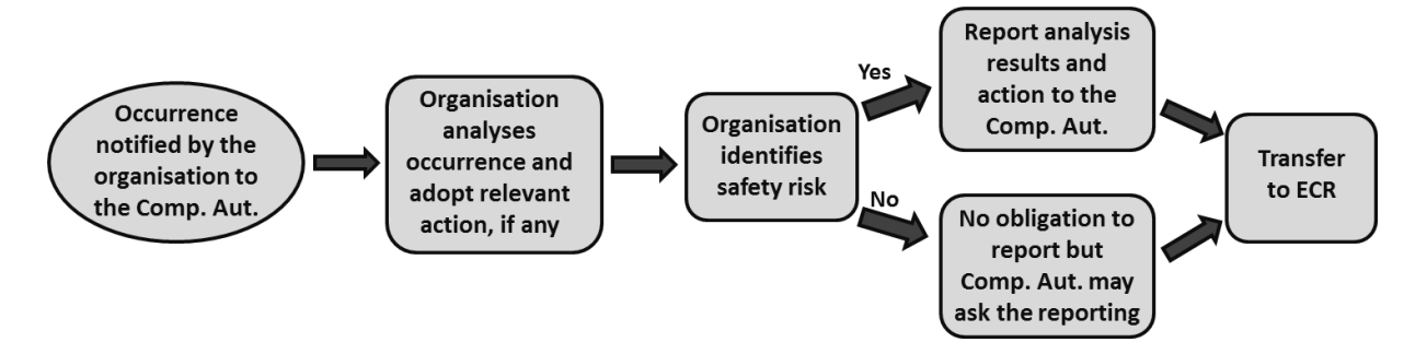
Diagram 4. Information flow related to analysis and follow-up related information

All occurrences collected by the organisation (MOR and VOR) are subject to analysis and follow-up requirements ( Article 13(1) and (2) ). However not all of them (i.e. only reportable ones — see i. above) are subject to further reporting obligations.