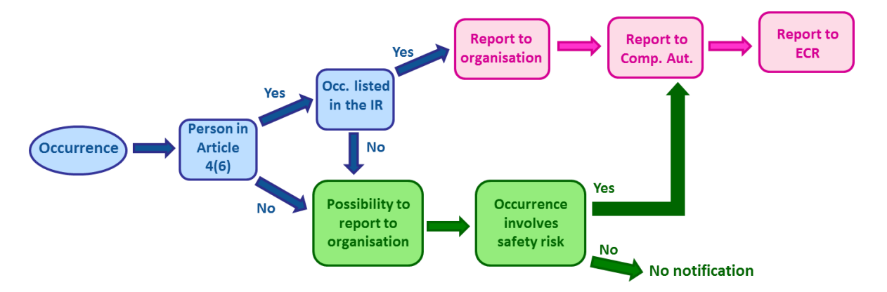
Diagram 3. Information flow related to the occurrence initial notification

Note: for the purpose of simplification, the scheme indicates that the reporting by individuals is made to the organisation while it is recognised by Regulation 376/2014 that individuals may report directly to the competent authority. See Section 2.8 for more information on the various reporting channels.